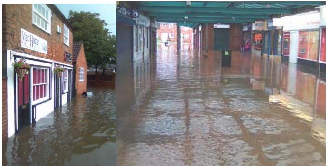
Flooding on Main Street, Calverton