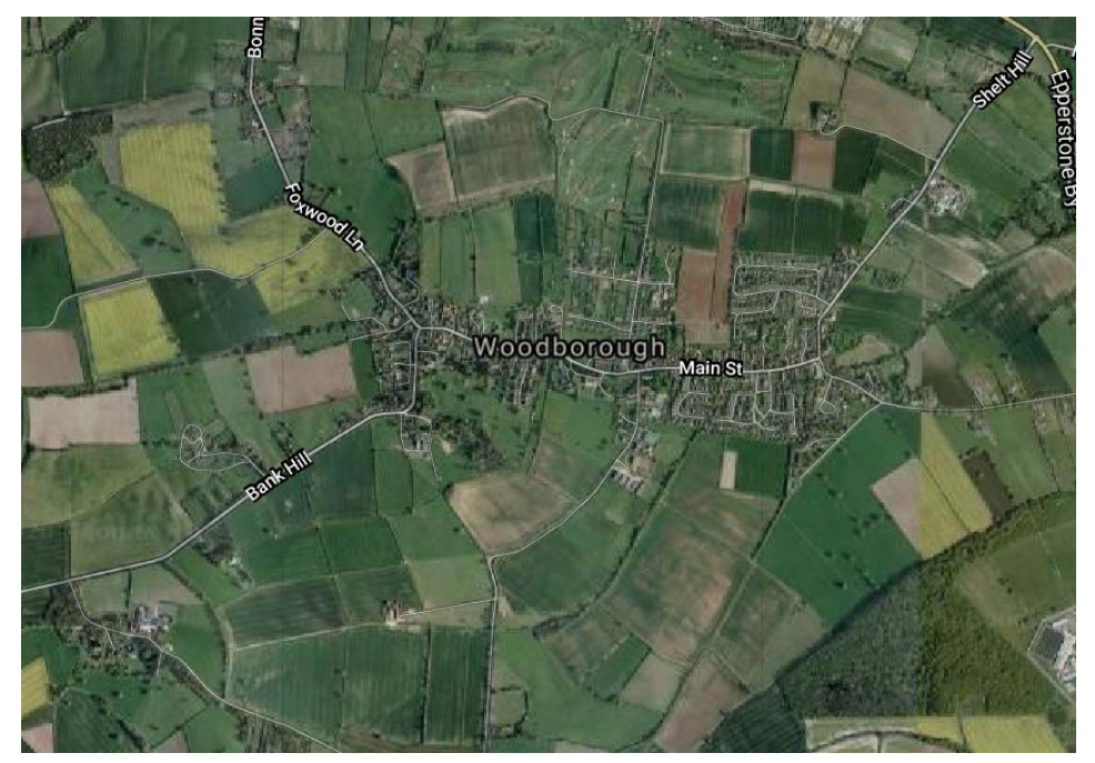
Figure 1. Location Plan

With the ground already saturated following one of the wettest autumn and winter periods on record, further intense rainfall on 16<sup>th</sup> February resulted in extensive flooding across the Nottinghamshire area, including Woodborough (Figure 1), a village with a population of approximately 1800 at the 2011 Census.