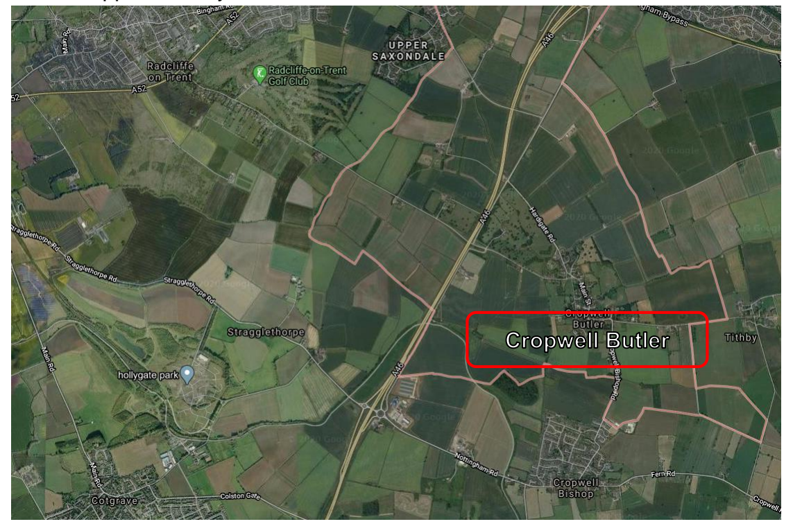
Figure 1. Location Plan

A major incident was declared at 07:00 on Sunday the 16<sup>th</sup> by the Tactical Co-Ordinating Group. With the ground already saturated following one of the wettest autumn and winter periods on record, further intense rainfall on 16<sup>th</sup> February resulted in extensive flooding across the Nottinghamshire area, including Cropwell Butler (Figure 1), a village with a population of approximately 600 at the 2011 Census.