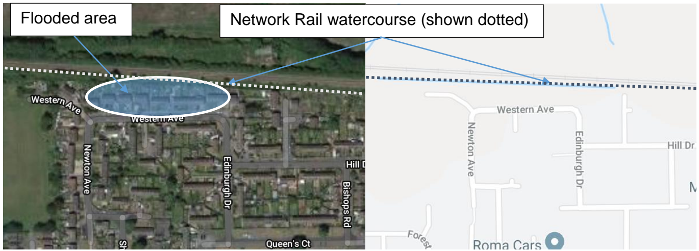
Figure 3. Western Avenue, Bingham showing flooded area and proximity to Network Rail watercourse.

On 16<sup>th</sup> February 2020 following the prolonged period of heavy rainfall, 10 properties on Western Avenue in Bingham suffered internal flooding.