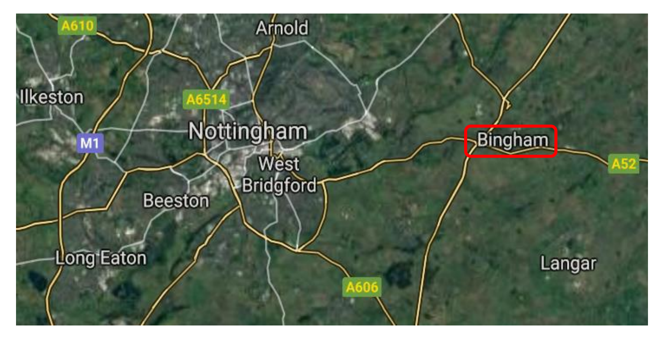
Figure 1. Location Plan

7. With the ground already saturated following one of the wettest autumn and winter periods on record, the heavy rain that fell on the 16<sup>th</sup> of February resulted in extensive flooding across the Nottinghamshire area, including Bingham (Figure 1), a market town with a population of approximately 9100 at the 2011 Census.