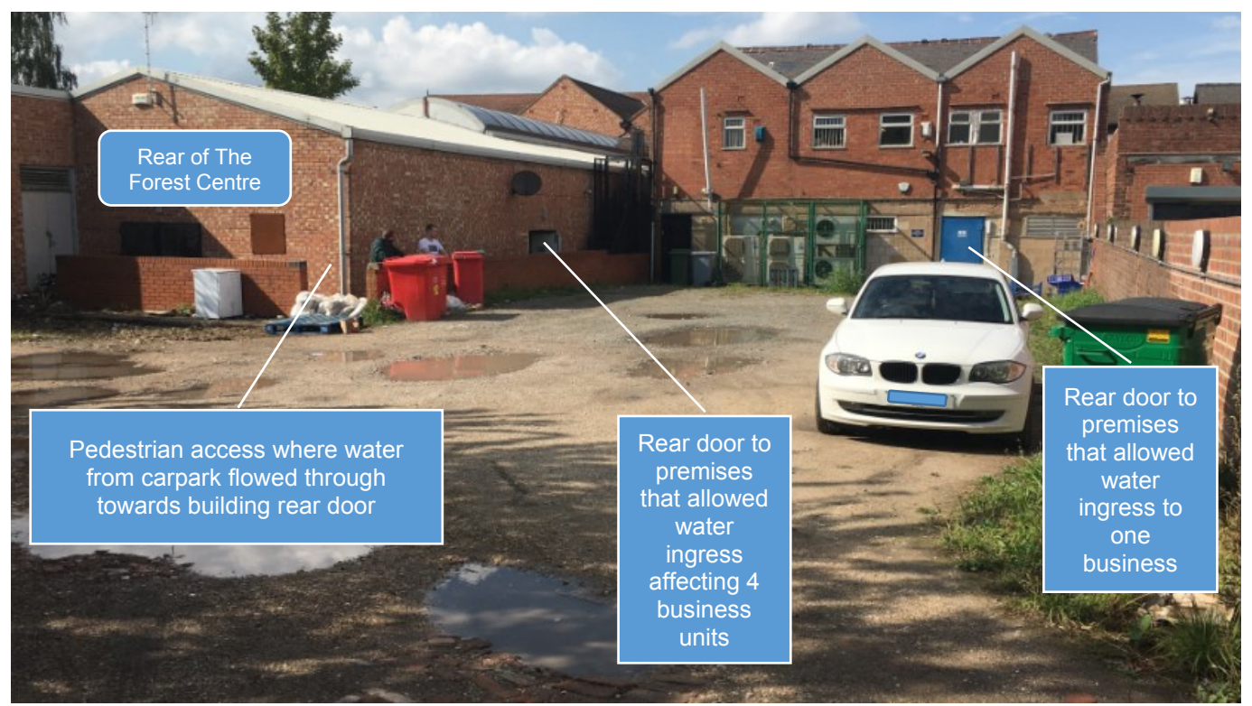
Figure 3. Photo showing flood entry points (taken at rear of The Forest Centre shopping arcade).