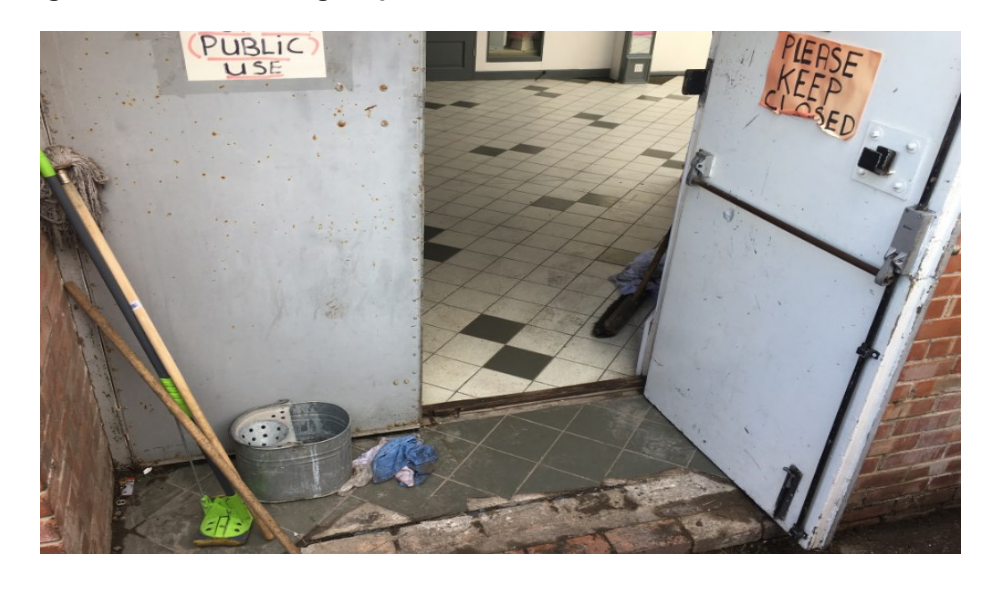
Figure 5. Photo showing rear access to The Forest Centre shopping arcade where flood water entered the building.