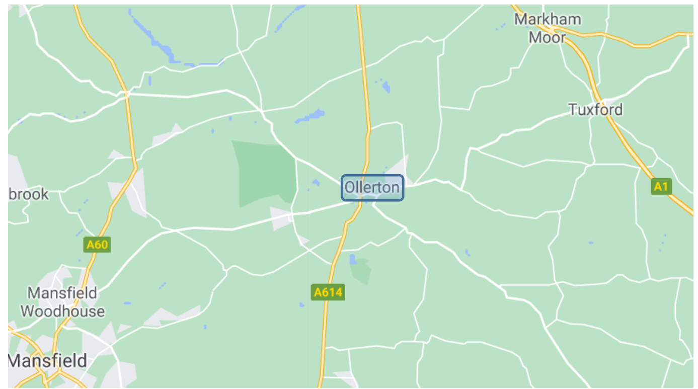
Figure 1. Location Plan.