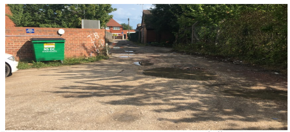
Figure 4. Photo showing carpark and access to rear of affected businesses.