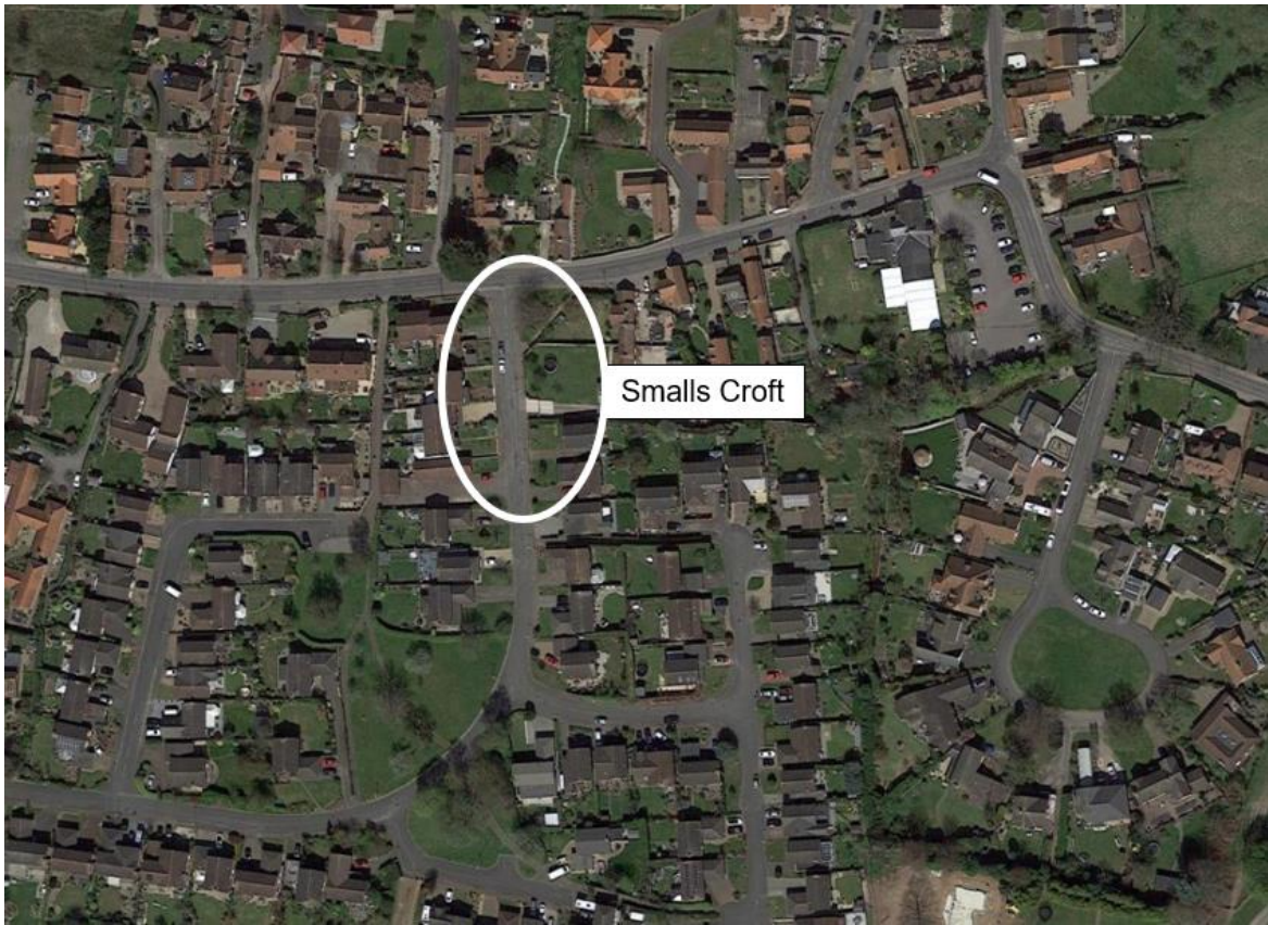
Figure 5. View of Smalls Croft.