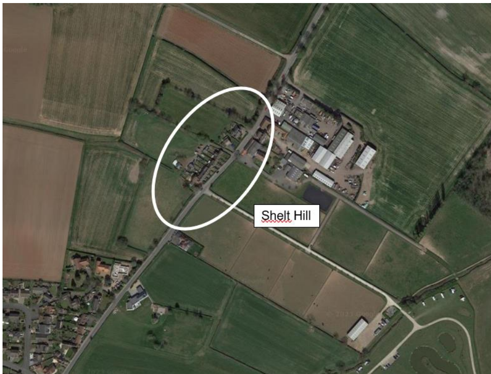
Figure 6. View of Shelt Hill.