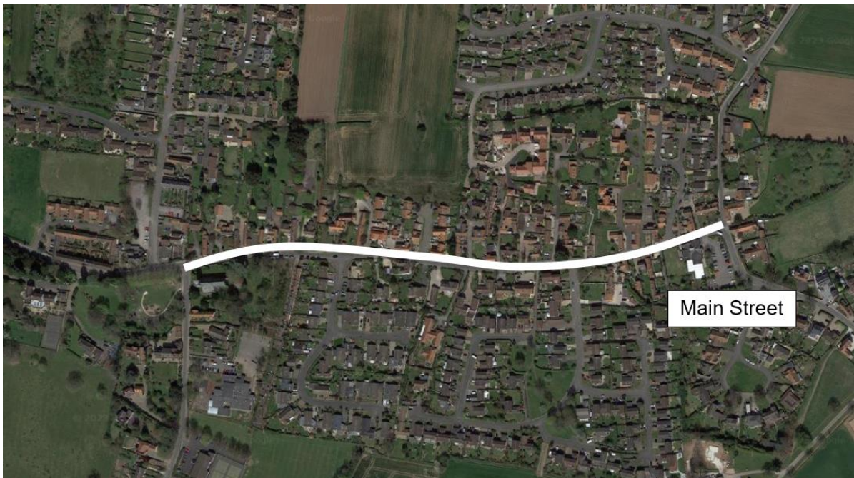
Figure 4. View of Main Street.