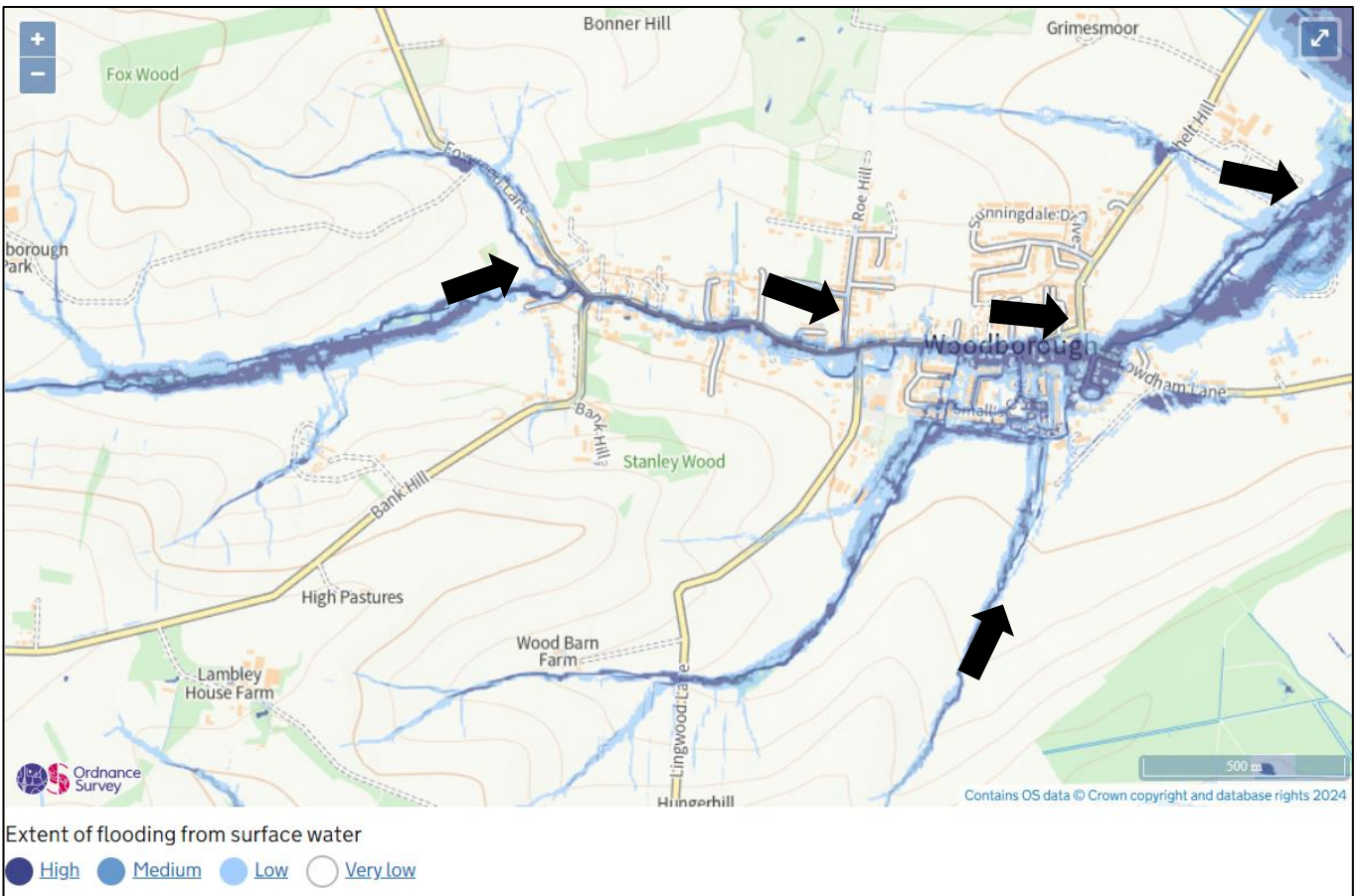
Figure 3. Surface Water Flood Risk Mapping - Woodborough. Data Supplied by Environment Agency.