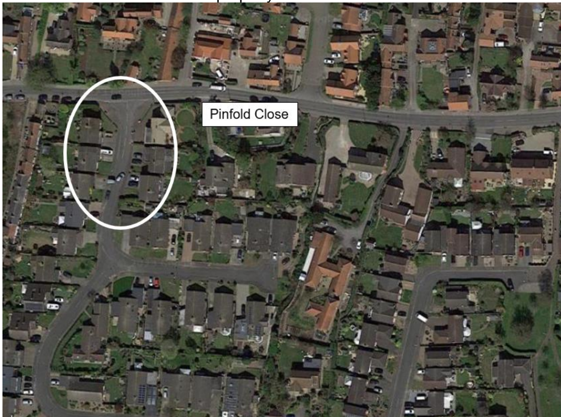
Figure 7. View of Pinfold Close.