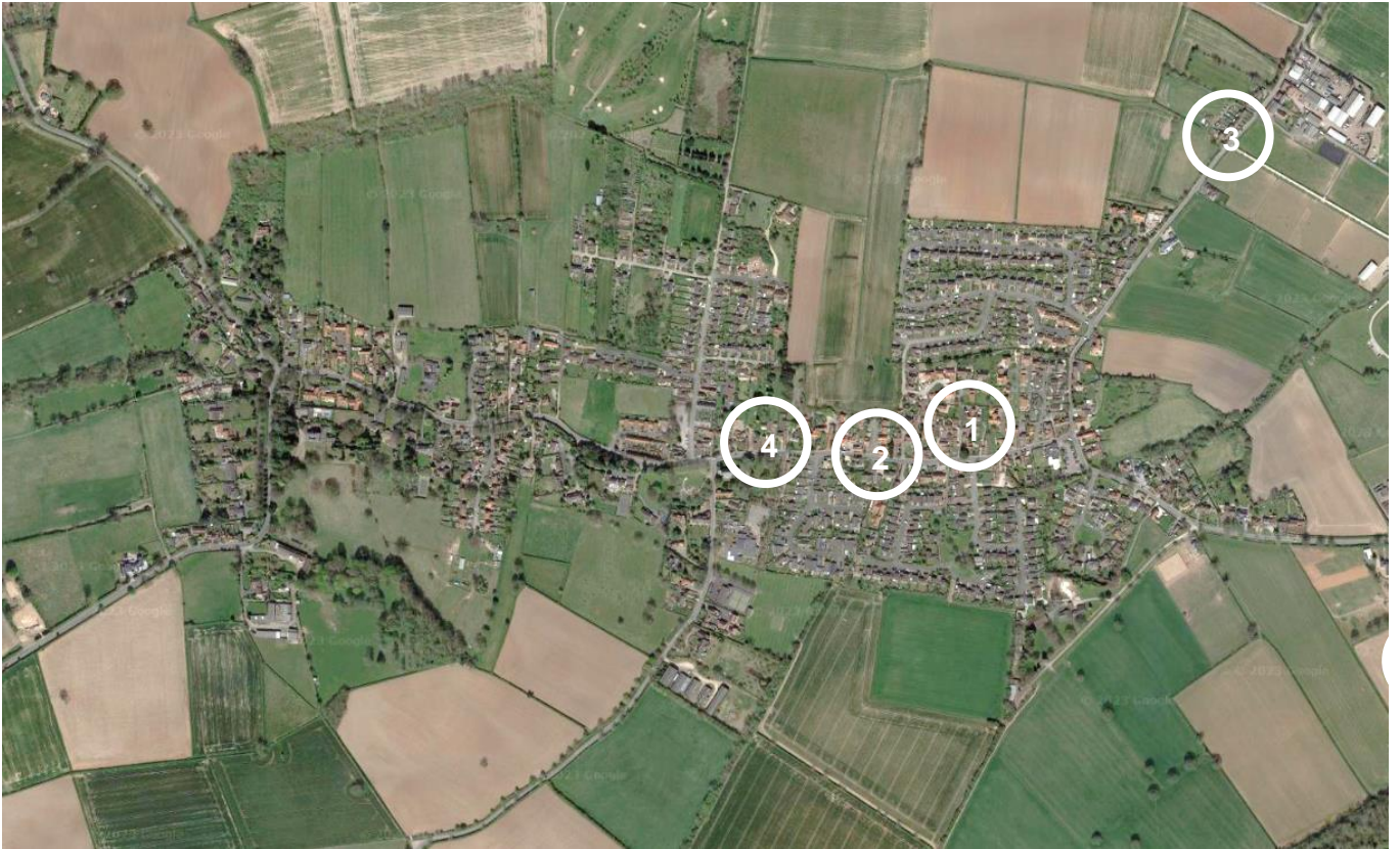
Figure 2. Reference Map for flood affected areas across Woodborough. Main Street (1), Smalls Croft (2), Shelt Hill (3), Pinfold Close (4).