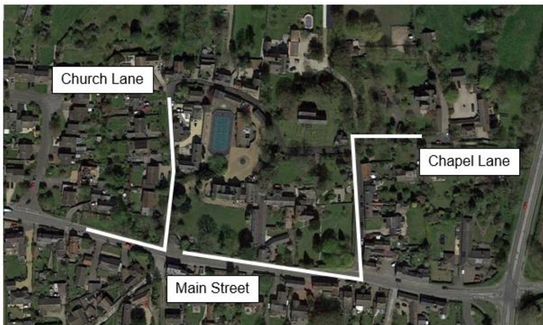
Figure 2. Reference map for flood affected areas across Costock. Main Street (2), Chapel Lane (2), Church Lane (4).