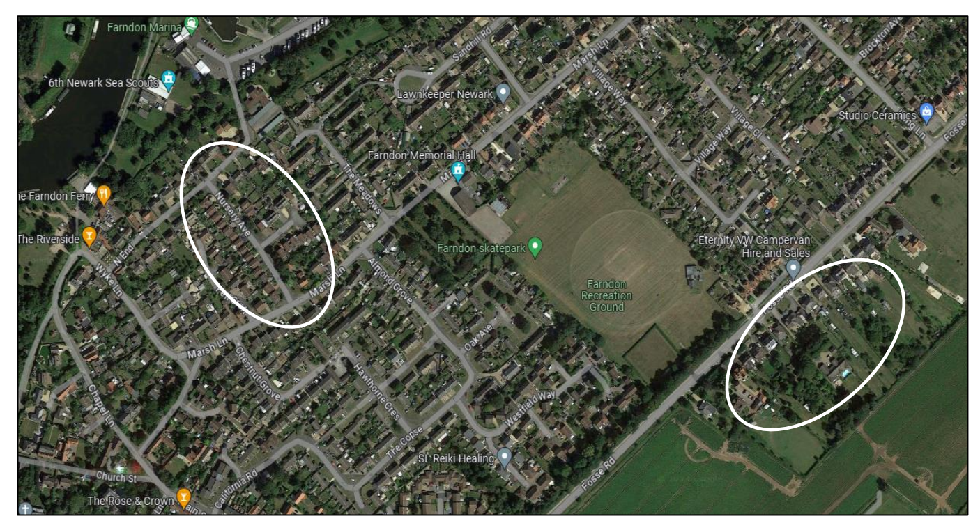
Figure 5. View of Farndon highlighting areas affected by internal flooding.

10. Figure 5 shows the areas affected by internal flooding.