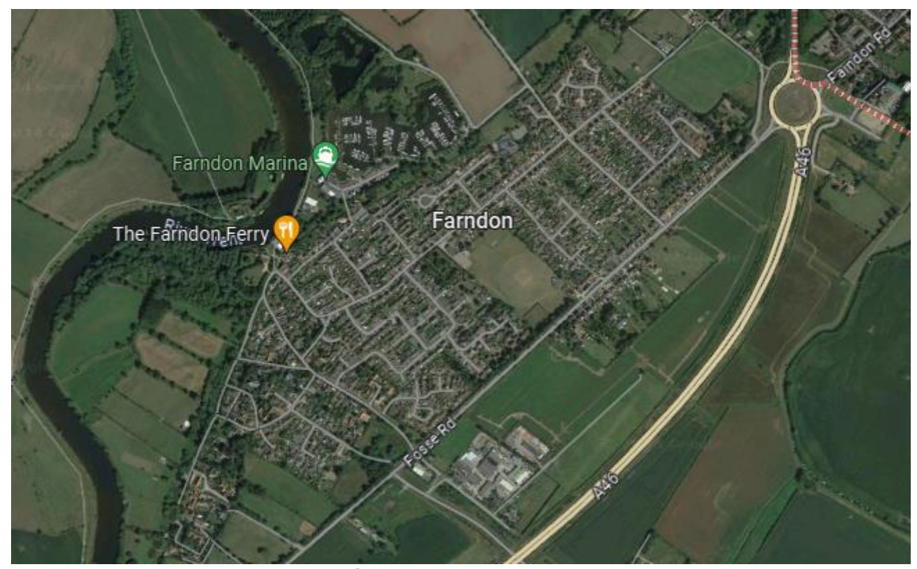
Figure 1 Farndon location map.

7. On the 2<sup>nd</sup> January 2024, Storm Henk brought heavy rain across the East Midlands resulting in widespread flooding across Nottinghamshire. This storm followed an extended period of rain across the county. The Lambley rain gauge, located approximately 15km to the west of Farndon, measured a total of 23.6mm of rain between 10am and 9pm and a peak of 6.4mm per hour. In the 48 hours prior to the storm, another 50mm of rain was recorded. Figure 2 shows the hourly rainfall at Lambley Gauge.