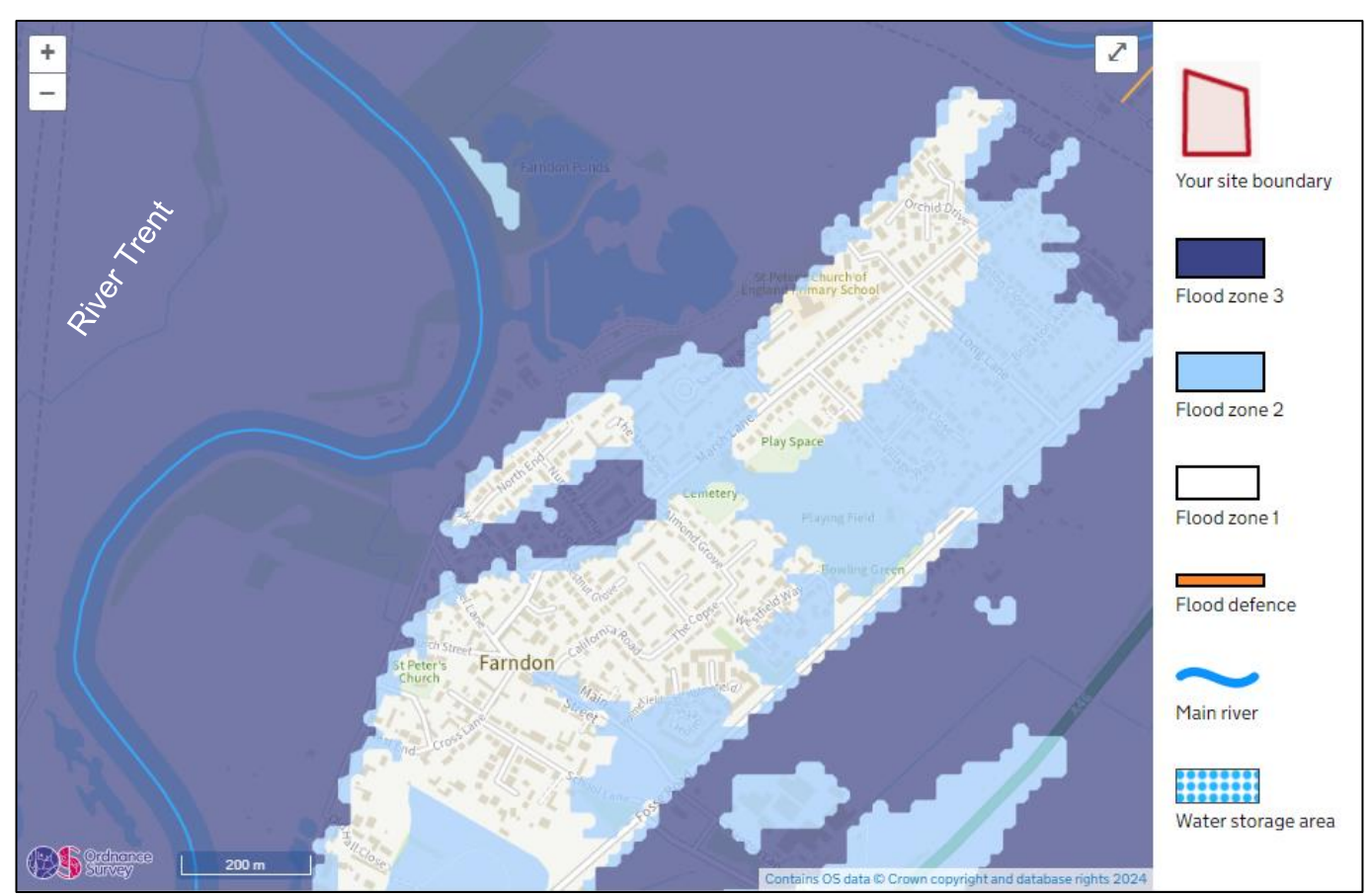
Figure 3. Predicted Flood Zone Extents (FZ3 is darkest area)