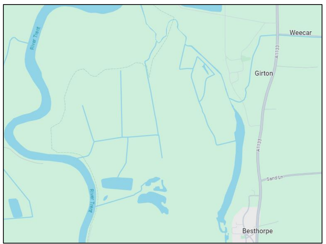
Figure 2. Girton showing its proximity to the River Trent.