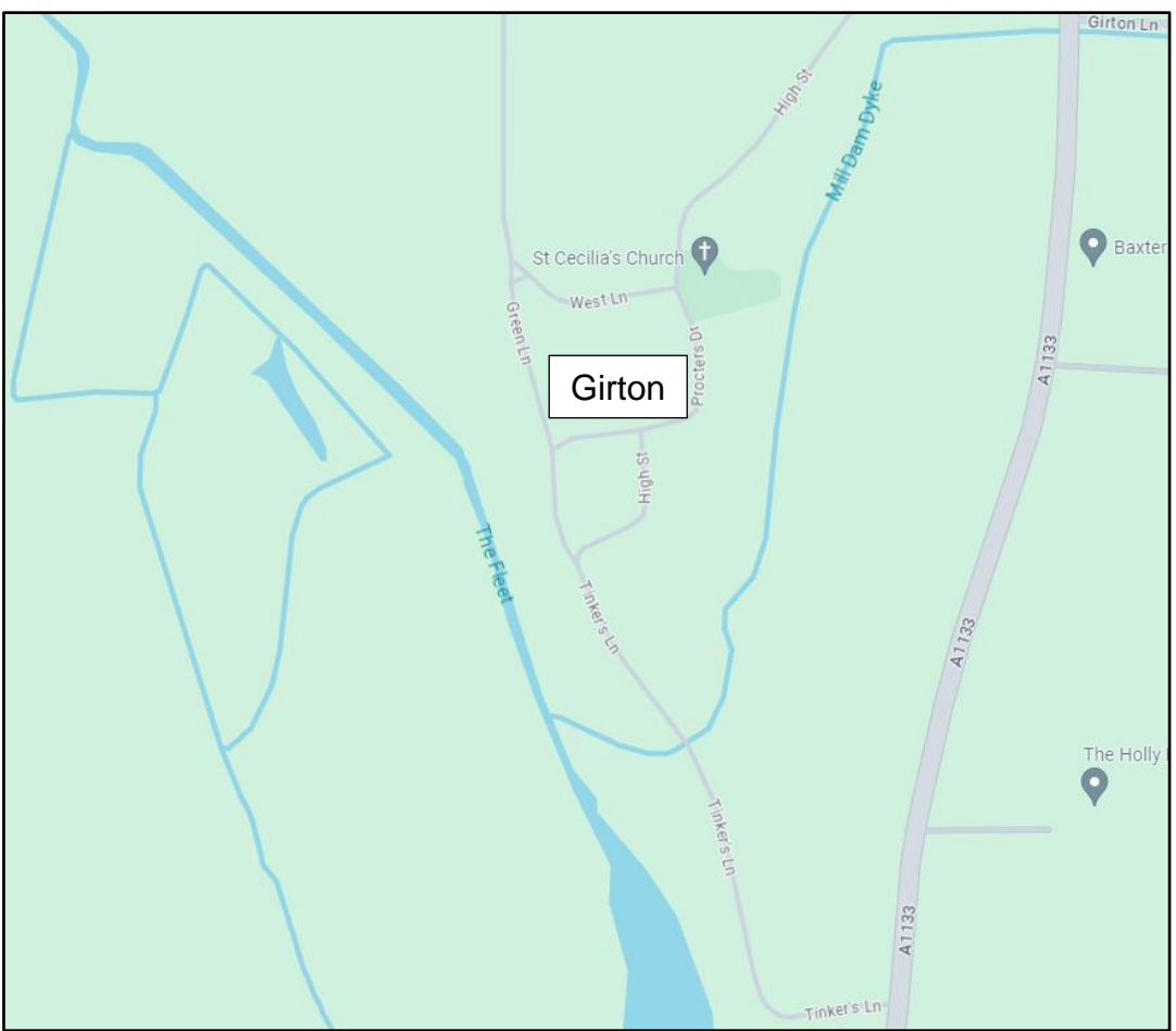
Figure 1. Girton showing its proximity to The Fleet and Mill Dam Dyke.

the River Trent north-west of the village. Figure 1 shows Girton and its proximity to the The Fleet and the Mill Dam Dyke, Figure 2 gives reference to the River Trent.